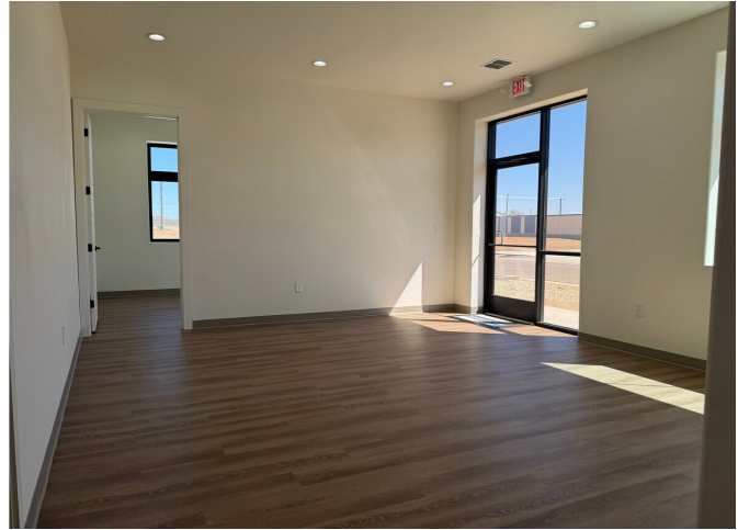
Open office — flexible layout