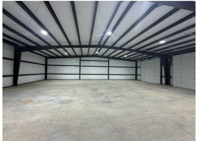
Warehouse — view toward overhead doors