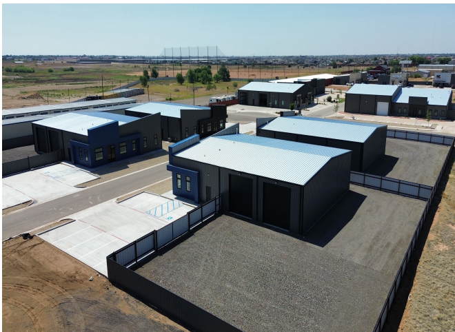
Building yard and fenced storage area