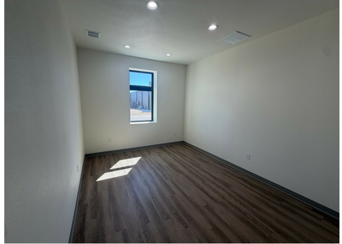
Private office / storage room