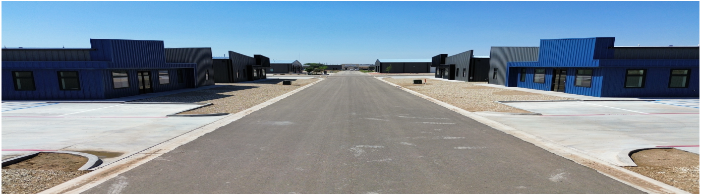
Triple C Business Park · South Lubbock, Texas

Contact us today to schedule a tour or request lease documents.