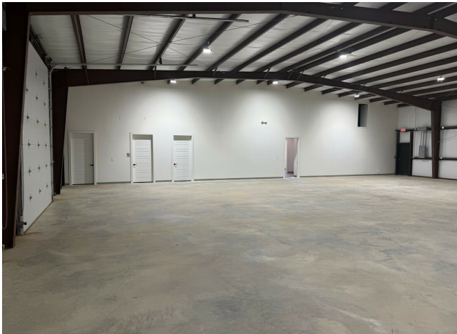
Warehouse interior — open span with LED lighting