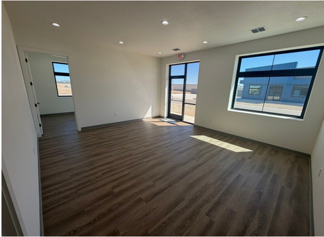
Main office area — LVT flooring & natural light

The 1,560 SF finished office suite features an open floor plan with natural light, luxury vinyl tile throughout, recessed LED lighting, and an ADA-compliant restroom. The 3,640 SF warehouse bay offers high-clearance open-span space with LED bay lighting, two 14' x 14' grade-level overhead doors, and direct yard access for truck loading.