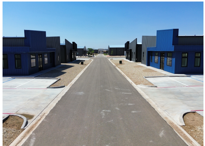
Campus corridor — buildings and approach road