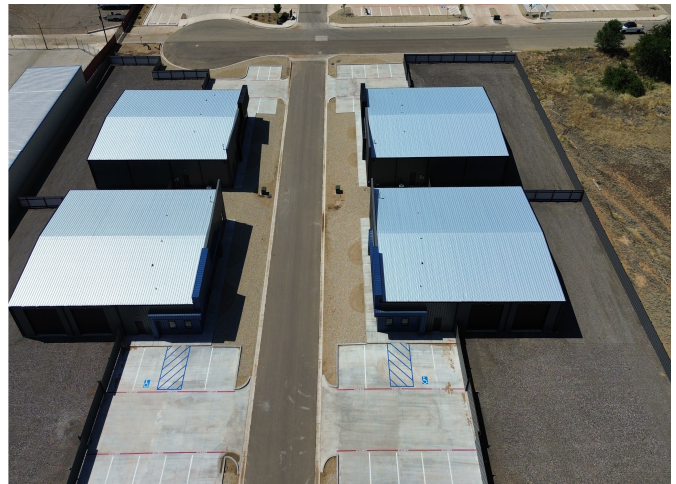
Overhead aerial — all four buildings and parking