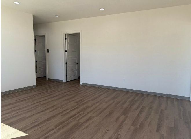
Secondary office / conference room