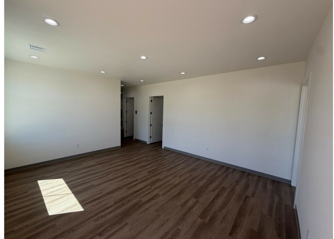
Office suite corridor