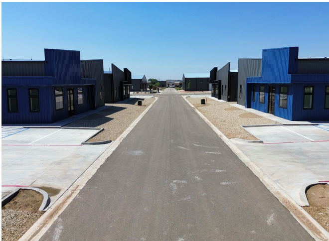
Triple C Business Park — campus street view