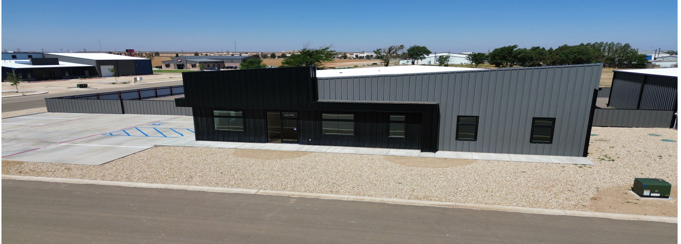
3208 118th Street — street-level front elevation