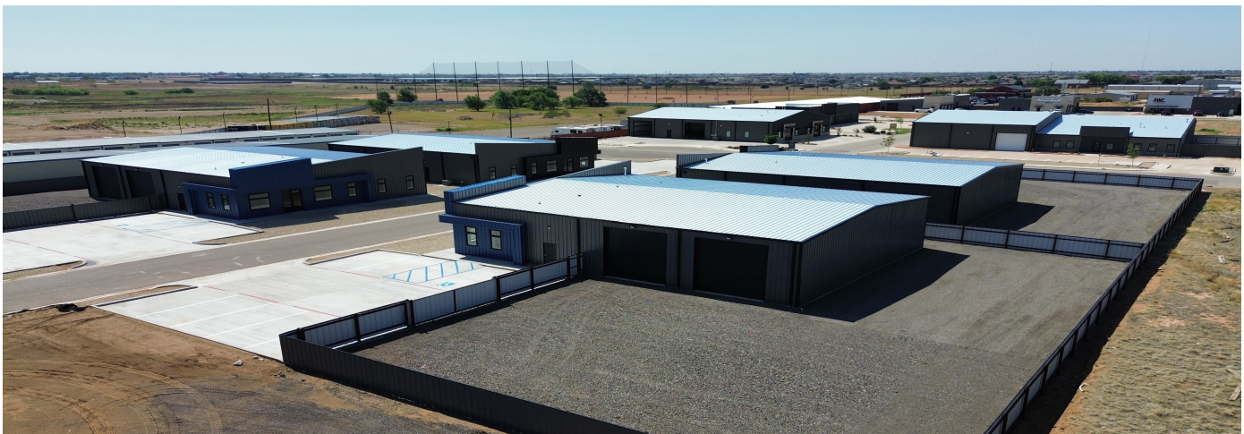
Triple C Business Park — aerial view showing campus layout and surrounding South Lubbock corridor